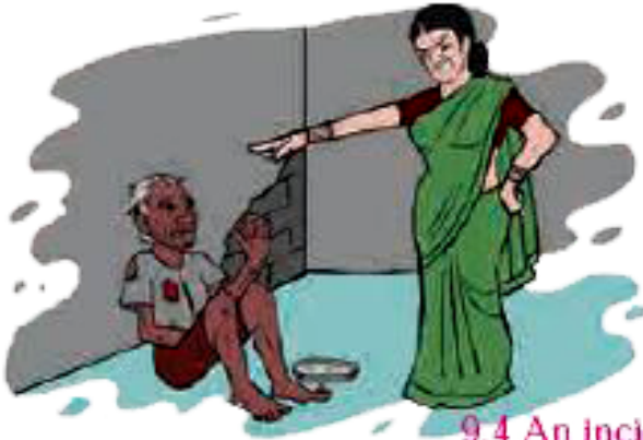
9.4 An incidence